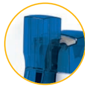
Optional 200-card hopper