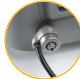
Kensington® lock secures the printer

The Datacard® SP55 Plus card printer combines high speed with exceptionally versatile capabilities.